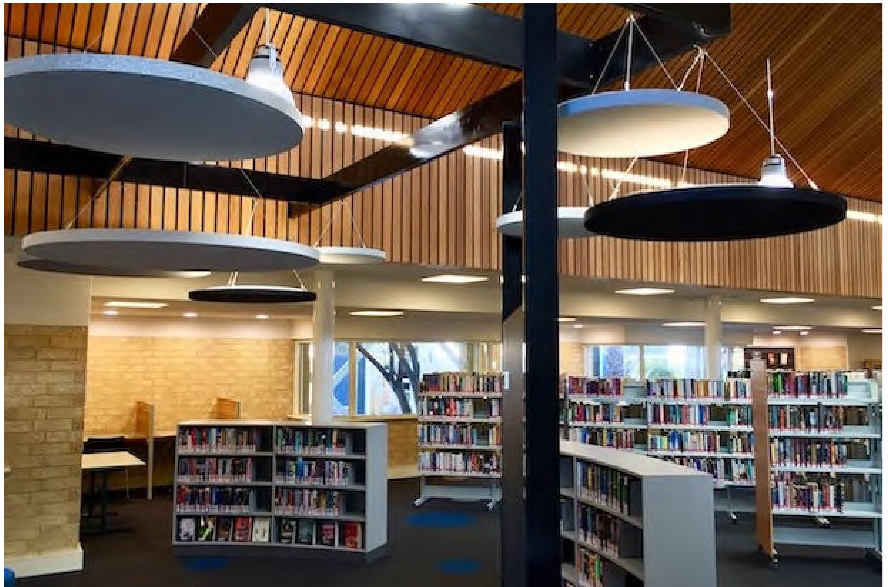
Osborne Park Library