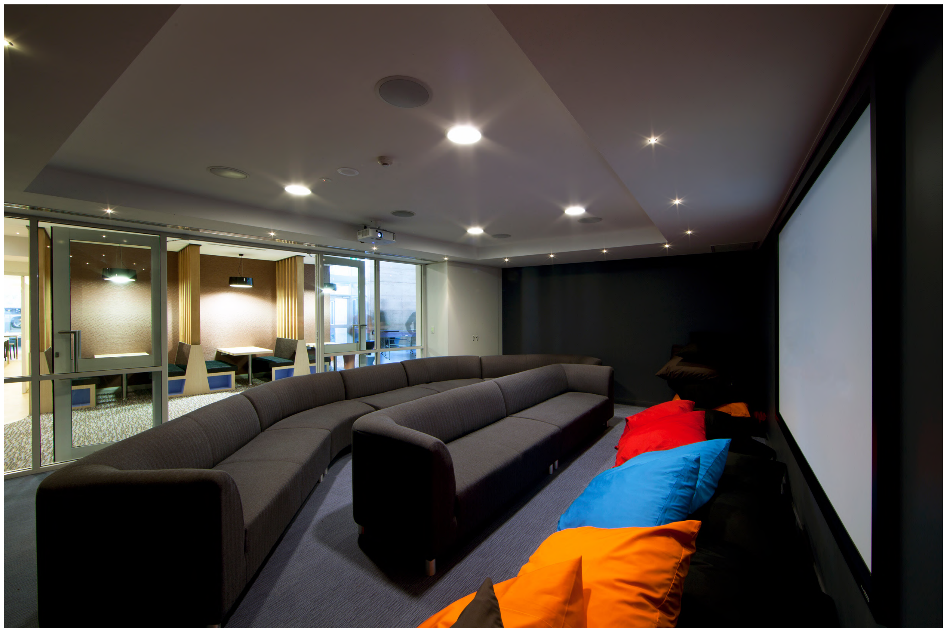
Clontarf Boarding Hostel