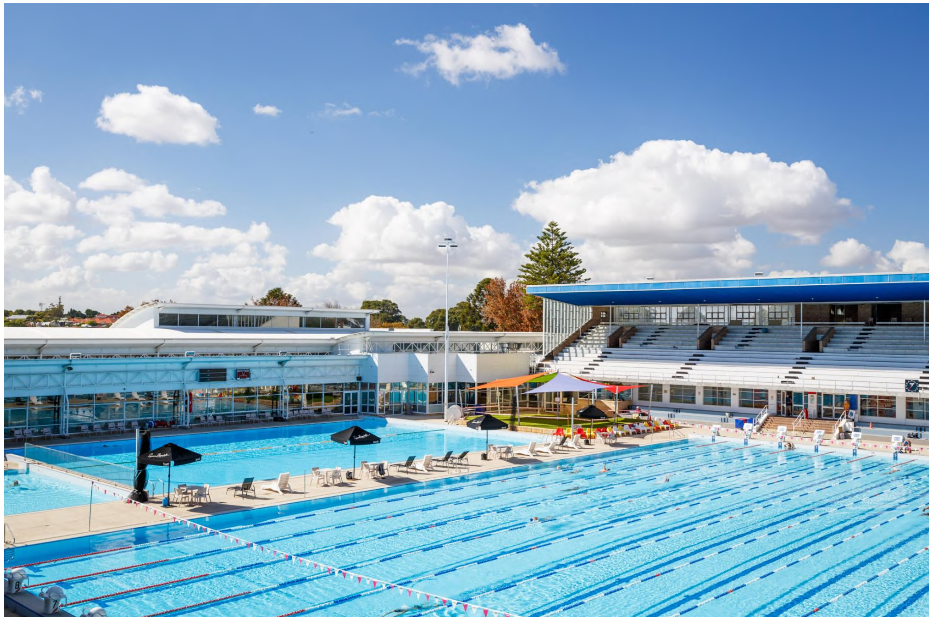
Beatty Park Aquatic Centre