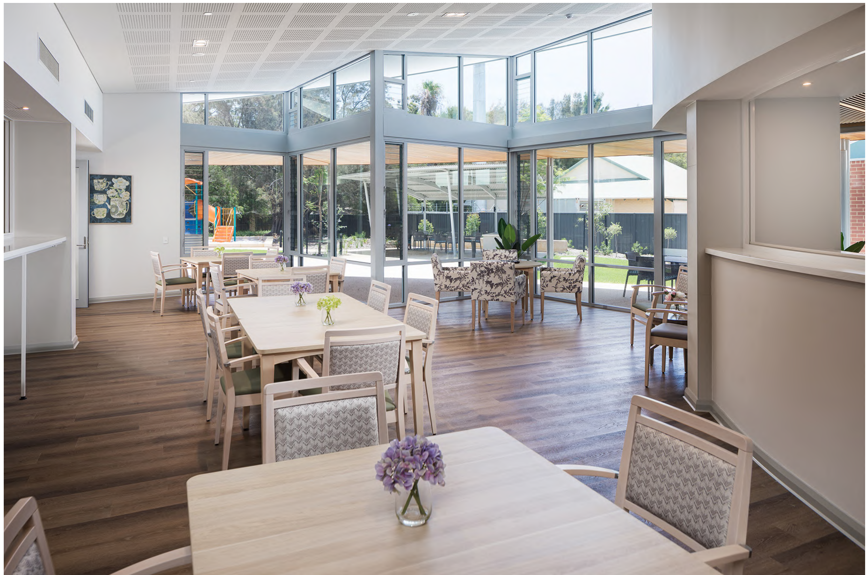
Acacia Living Meadow Springs Aged Care Centre