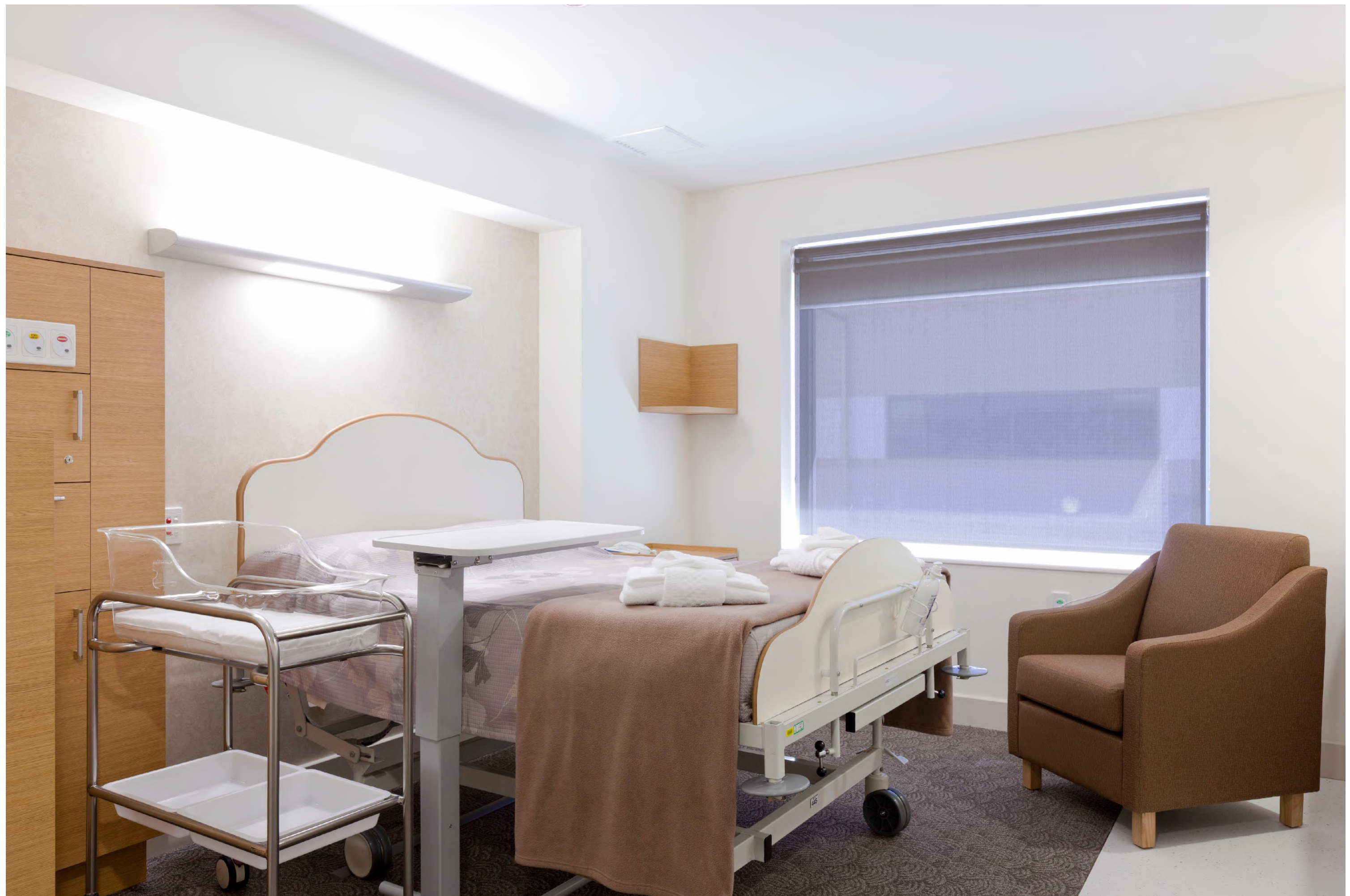
Joondalup Hospital Mental Health Unit Expansion