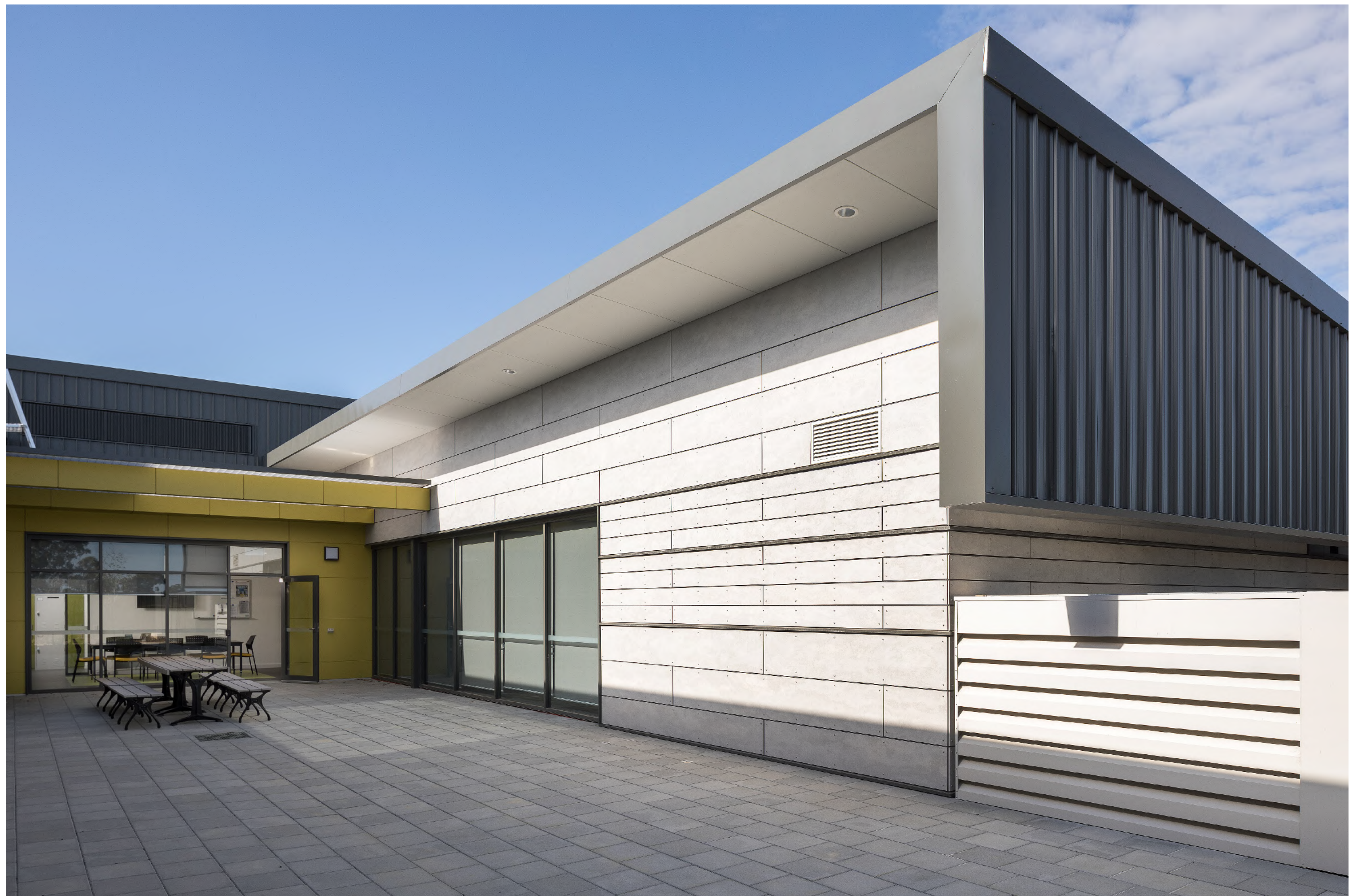
Mundijong Police Station