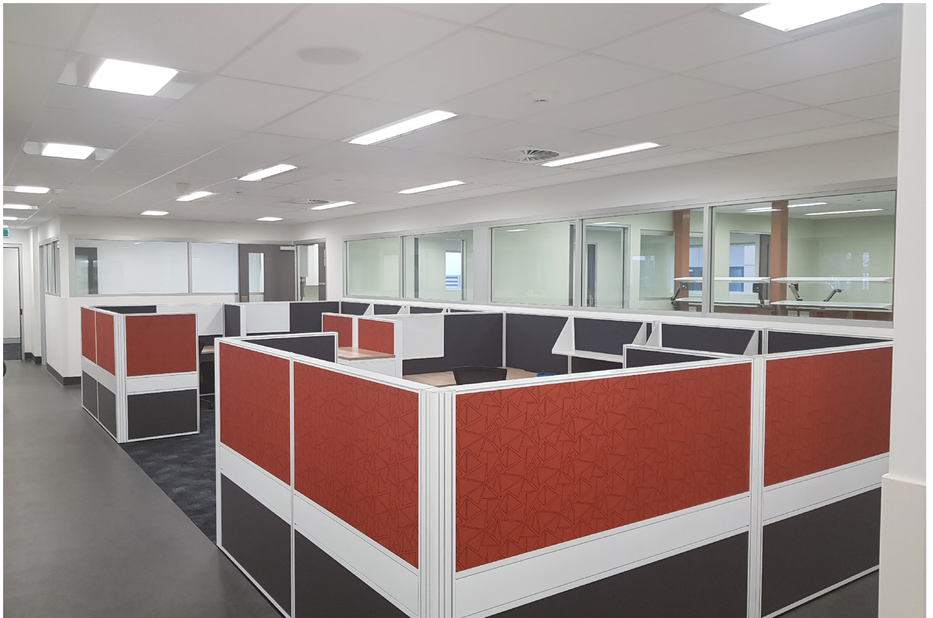
Perth Mint Refinery Assay Laboratory Expansion