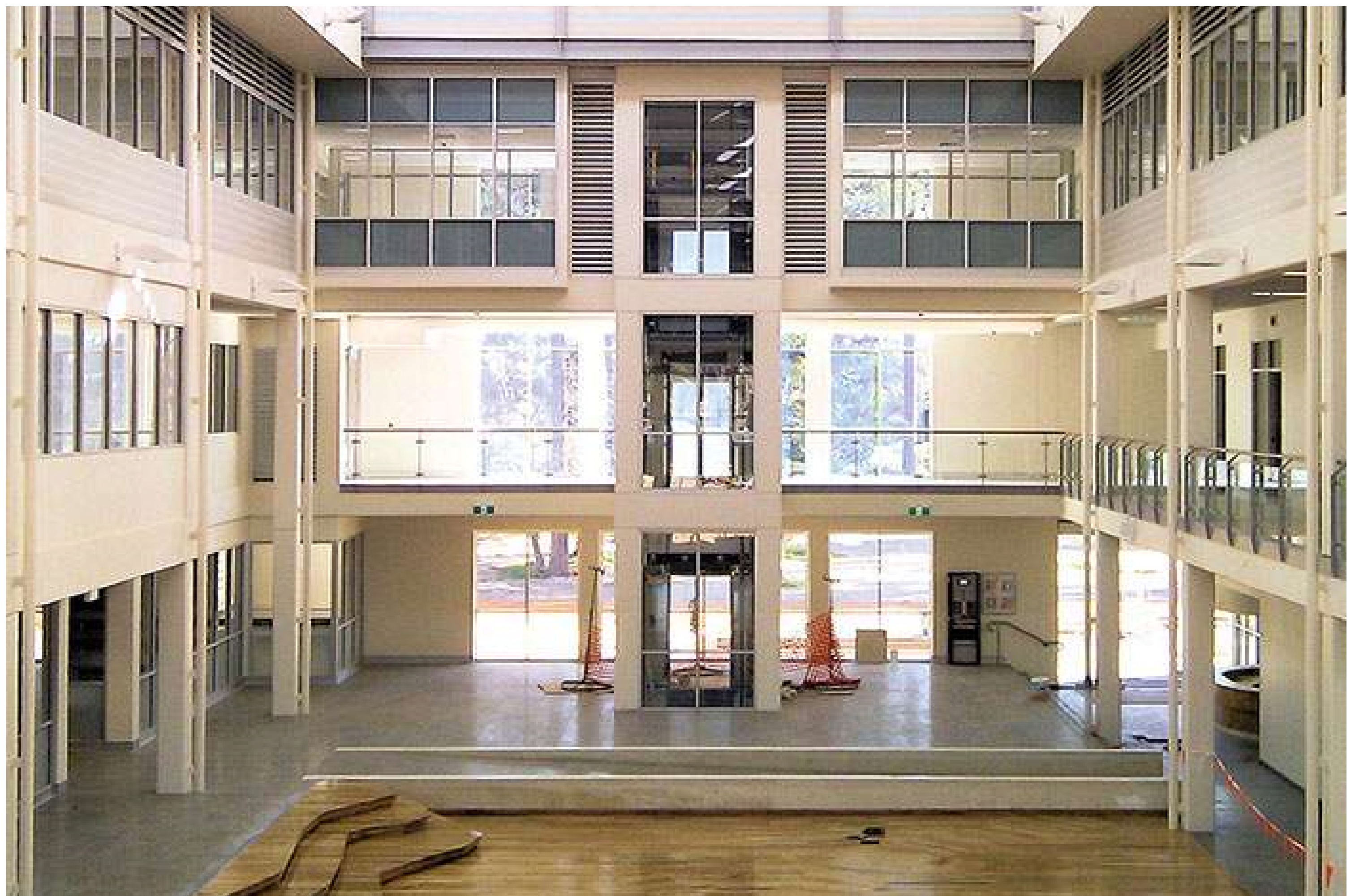
Perth Bio Diversity Science Centre