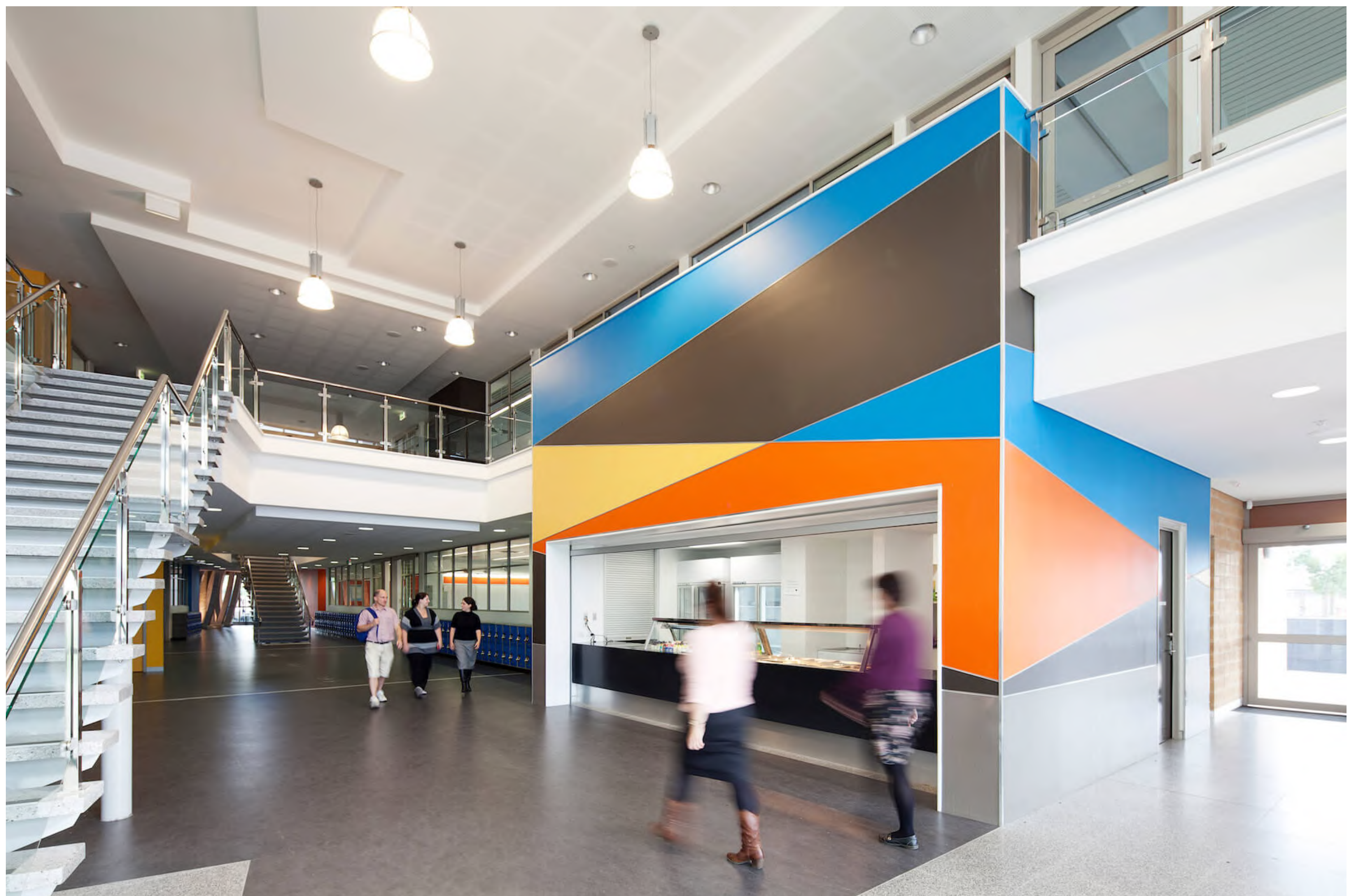
Ellenbrook Secondary College